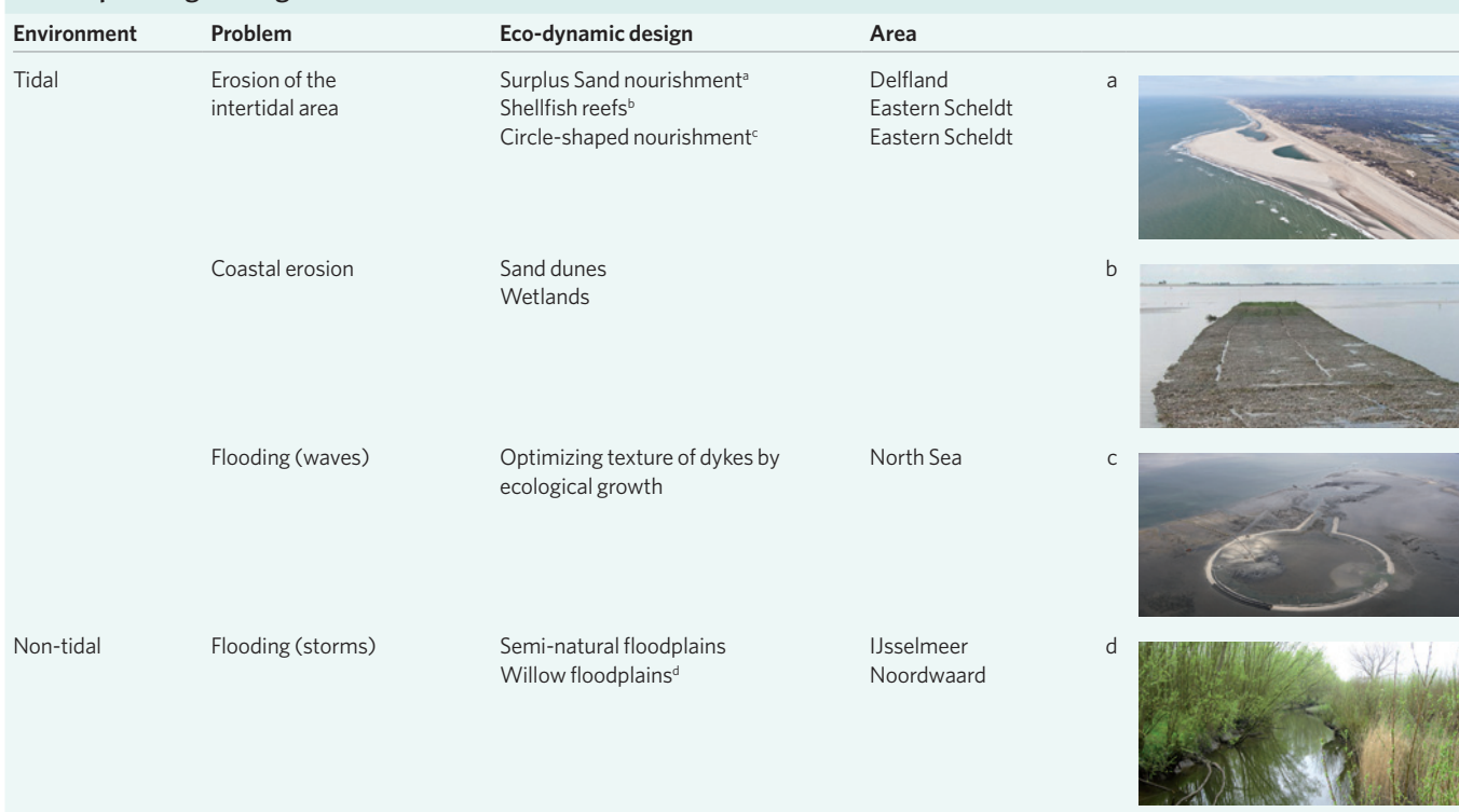
Table 4 | Eco-engineering solutions for coastal areas in the Netherlands.

a–d refer to the photographic examples of eco-dynamic design shown on the right. Eco-dynamic designs are based on the dynamics of the natural environment: developing hydraulic engineering infrastructure and at the same time creating opportunities for nature and the environment. Sand nourishment is a technique where extra sand is deposited in an (intertidal) area to counter losses from erosion. In the Delfland Sand Engine experiment, a larger than normal (surplus) nourishment of 21.5 million m 3 of sand was introduced, rising up to 7 m above mean sea level. The sand is gradually redistributed by natural processes over the shoreface beach and dunes 92 . http://www.ecoshape.nl/en_GB/delfland-sand-engine.html